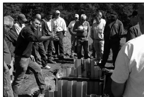
...And in the ground.