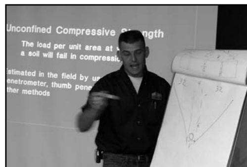
Train in the classroom...