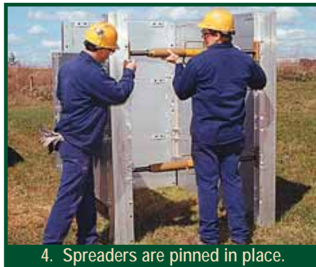
4. Spreaders are pinned in place.