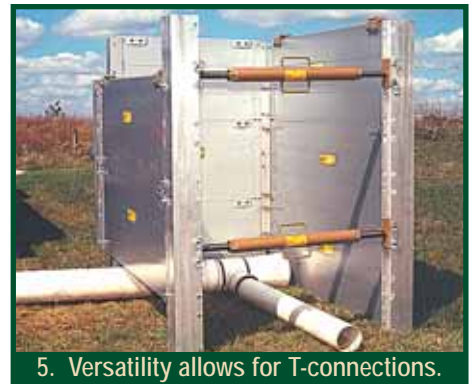
5. Versatility allows for T-connections.