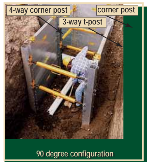
90 degree configuration