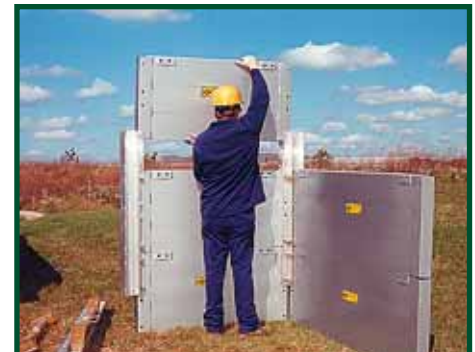
2. Panels are set into corner end posts.