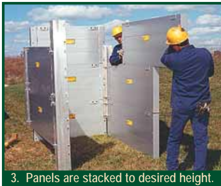
3. Panels are stacked to desired height.