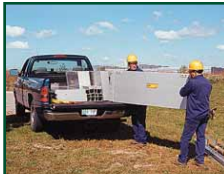
1. Transported by Pick-up truck.