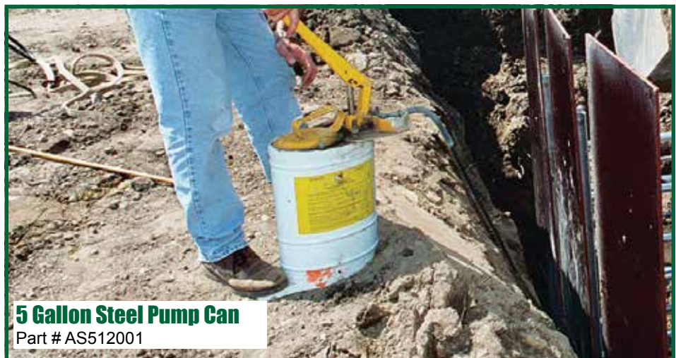
5 Gallon Steel Pump Can