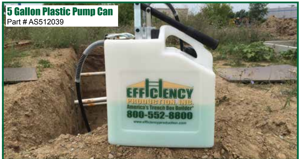
5 Gallon Plastic Pump Can

Mix one (1) part All-Season SF to four (4) parts clean water for protection over 30° F